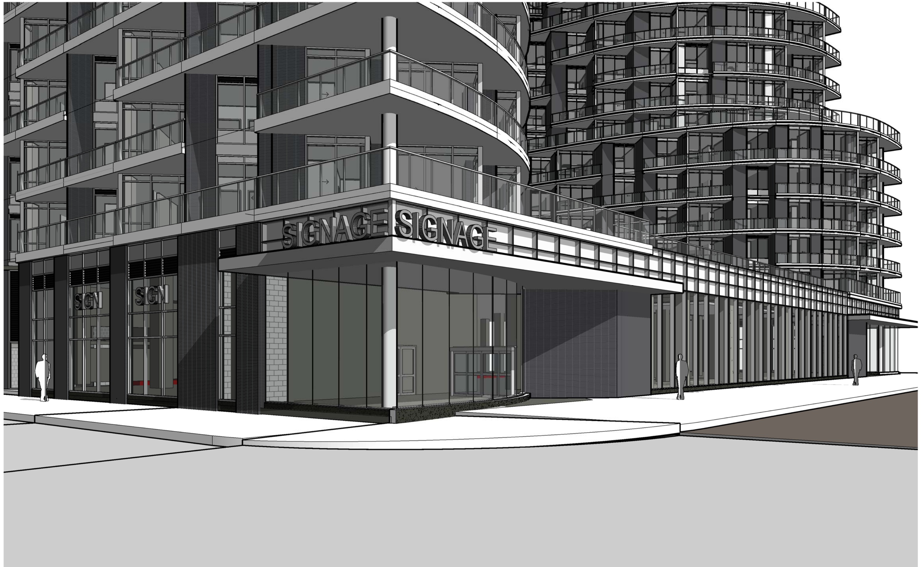
MONDAY'S OPTION (01/26) - Continuous storefront + recessed terrace railing