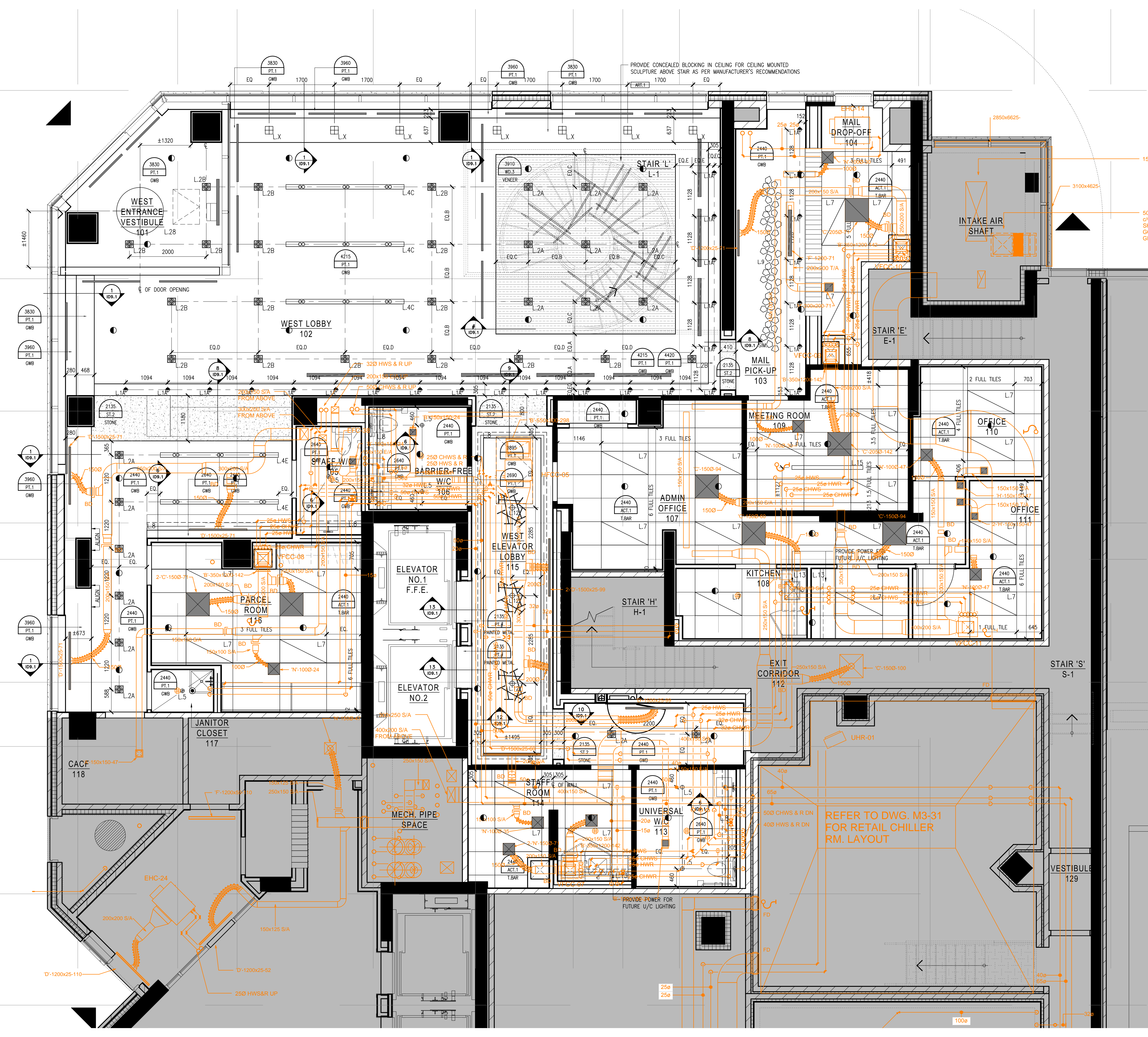
1 REFLECTED CEILING PLAN SCALE: 1:50

Notes: CONTRACTOR AND ALL SUB-TRADES SHALL VERIFY ALL SITE DIMENSIONS. ALL DRAWINGS, DETAILS AND SPECIFICATIONS AND REPORT ANY DISCREPANCIES TO THE INTERIOR DESIGNER IN WRITING FOR APPROVAL BEFORE PROCEEDING WITH THE WORK. CONTRACTOR AND SUB-CONTRACTORS, BEFORE PROCEEDING WITH WORK, MUST SUBMIT ALL NECESSARY SAMPLES FOR APPROVAL OF QUALITY AND FINISH TO THE INTERIOR DESIGNER. CONTRACTOR MUST COMPLY WITH THE CONTRACT DOCUMENTS, PERFORMANCE REQUIREMENTS, APPLICABLE CODES AND REGULATIONS. ALL DRAWINGS AND WRITTEN MATERIAL HEREIN CONSTITUTES THE ORIGINAL AND UNPUBLISHED WORK OF "IBBY DESIGN ASSOCIATES INC." AND MAY NOT BE DUPLICATED, USED OR DISCLOSED WITHOUT PRIOR WRITTEN CONSENT OF "IBBY DESIGN ASSOCIATES INC." DRAWINGS NOT TO BE SCALED Issue: 01 ISSUED FOR COORDINATION 15.04.09 02 ISSUED FOR COORDINATION 15.04.13 03 ISSUED FOR COORDINATION 15.11.11 04 ISSUED FOR COORDINATION 16.01.11 05 ISSUED FOR CLIENT REVIEW 16.01.15