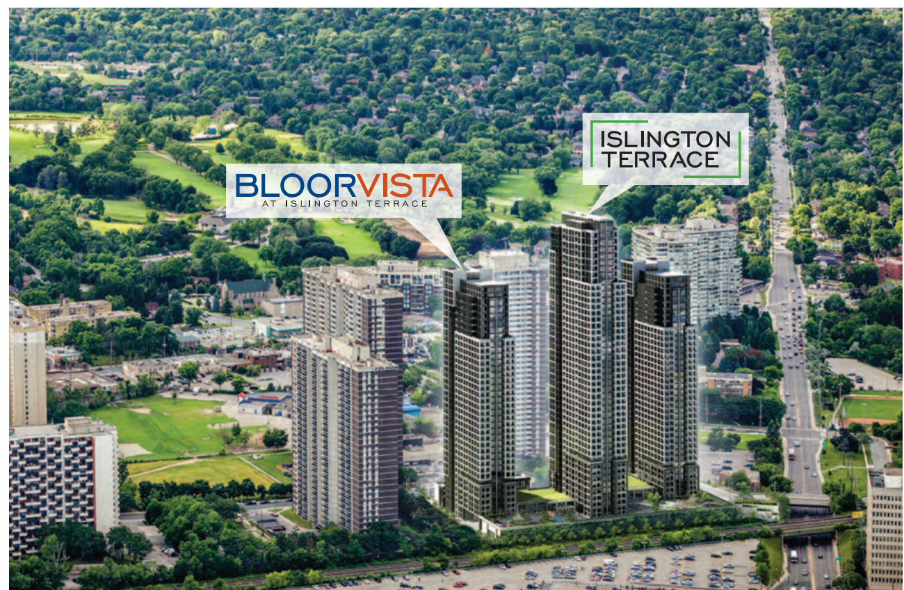
This rendering has been visually enhanced to better represent the architectural features of the Islington Terrace community. The building located at 50 Cordova Ave. has been removed. E. & O.E.

Views in all directions reveal green, as far as the eye can see. There's the lush parklands of Thomas Riley Park through which Mimico Creek flows, offering recreational activities and hiking/biking trails. And then there are 5 magnificently maintained golf courses just moments away. This golfer's haven includes St. George's Golf & Country Club, Islington Golf Club, Lambton Golf & Country Club, Weston Golf & Country Club and Markland Wood Golf Club.