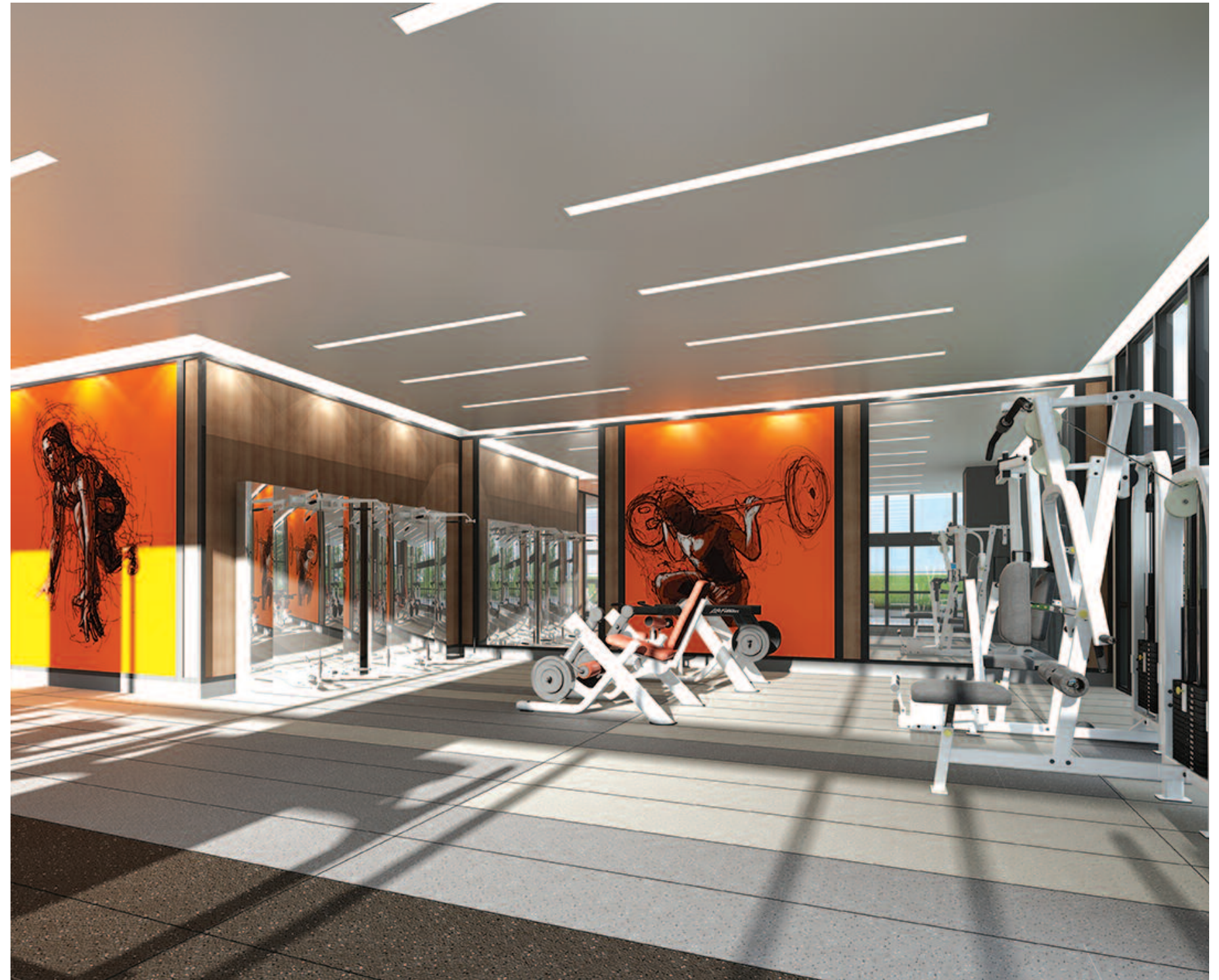
Weight training area