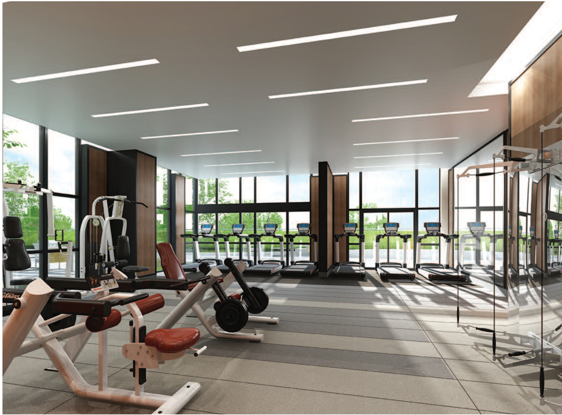
State-of-the-art Fitness Centre