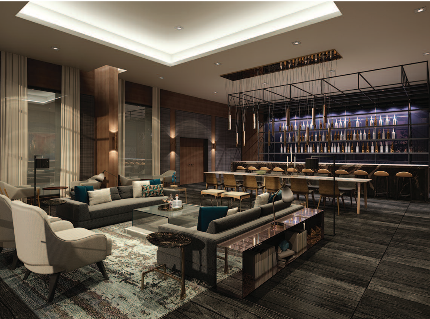
Chic Party Room with bar, lounge and dining areas.

50,000 SQ.FT. OF INDULGENT AMENITY SPACES, THAT FLOW FROM INDOORS TO OUTDOORS