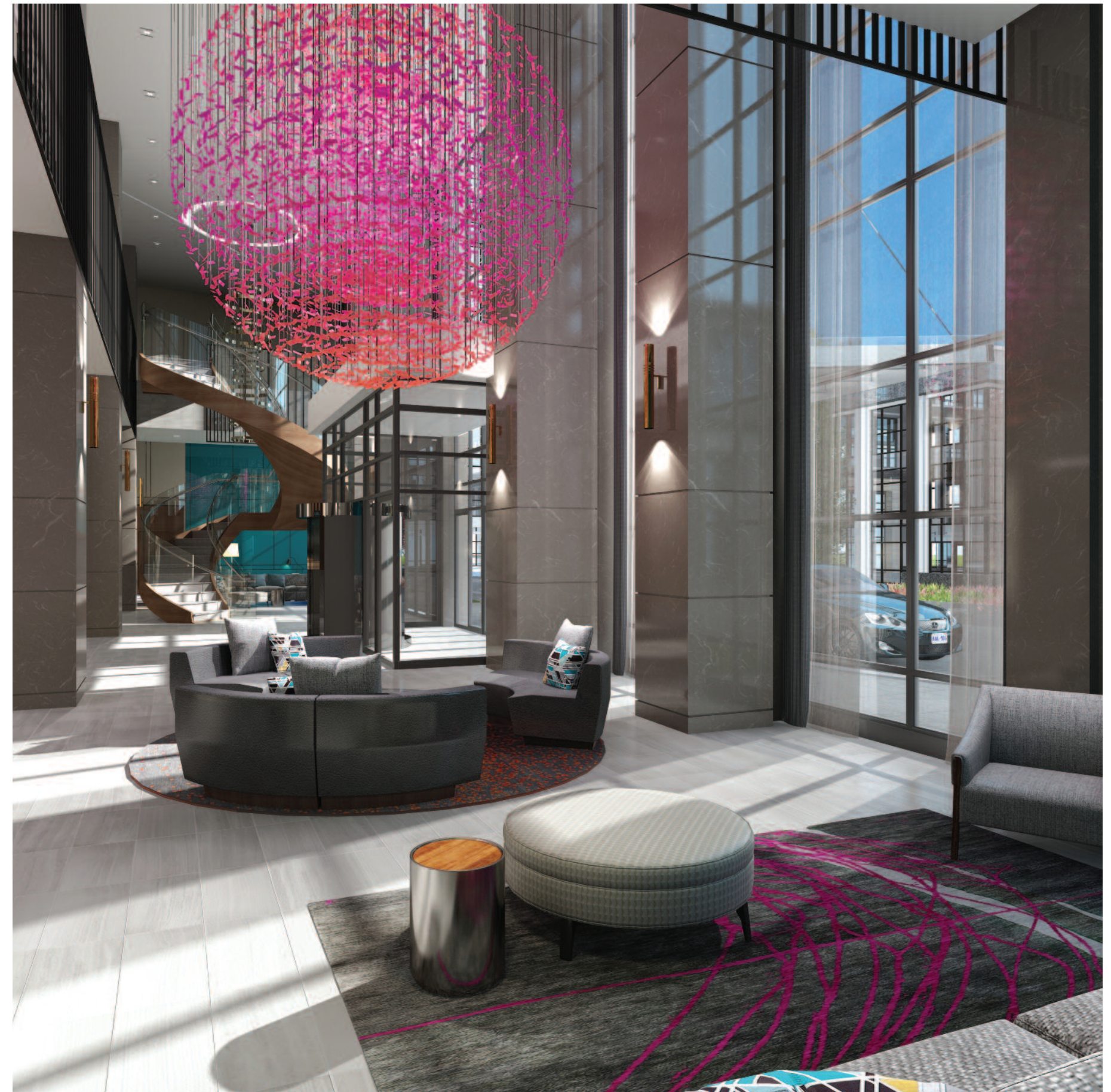
The light-infused two-storey Lobby with show-stopping circular staircase.

The light-infused two-storey Lobby makes a dramatic opening statement with its clean linear modern design, elegant designer chandelier, stylish lounging areas and show-stopping circular staircase. A Concierge will be on duty to greet guests and welcome residents home.