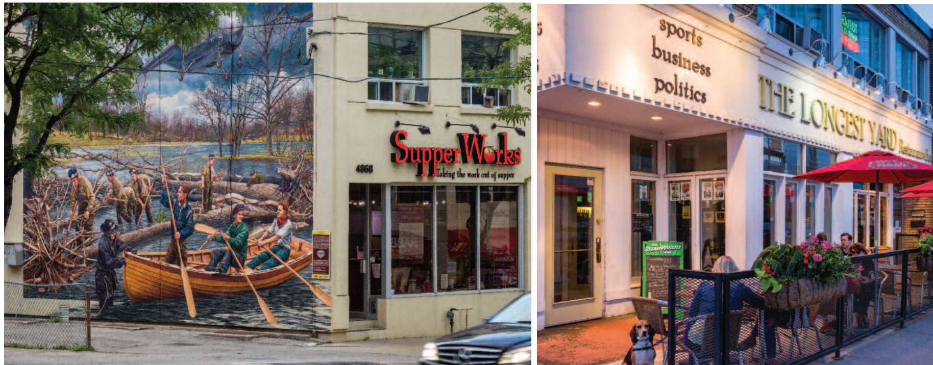
THE VIBRANT OFFERINGS OF HISTORIC ISLINGTON VILLAGE