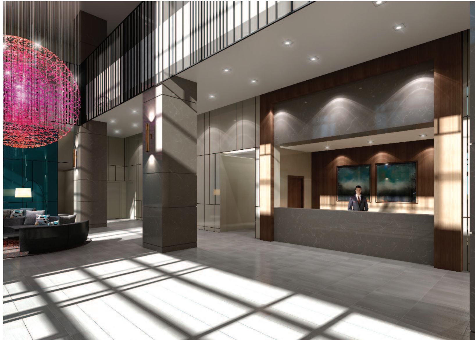
A Concierge is on duty to greet guests and residents.

The light-infused two-storey Lobby makes a dramatic opening statement with its clean linear modern design, elegant designer chandelier, stylish lounging areas and show-stopping circular staircase. A Concierge will be on duty to greet guests and welcome residents home.