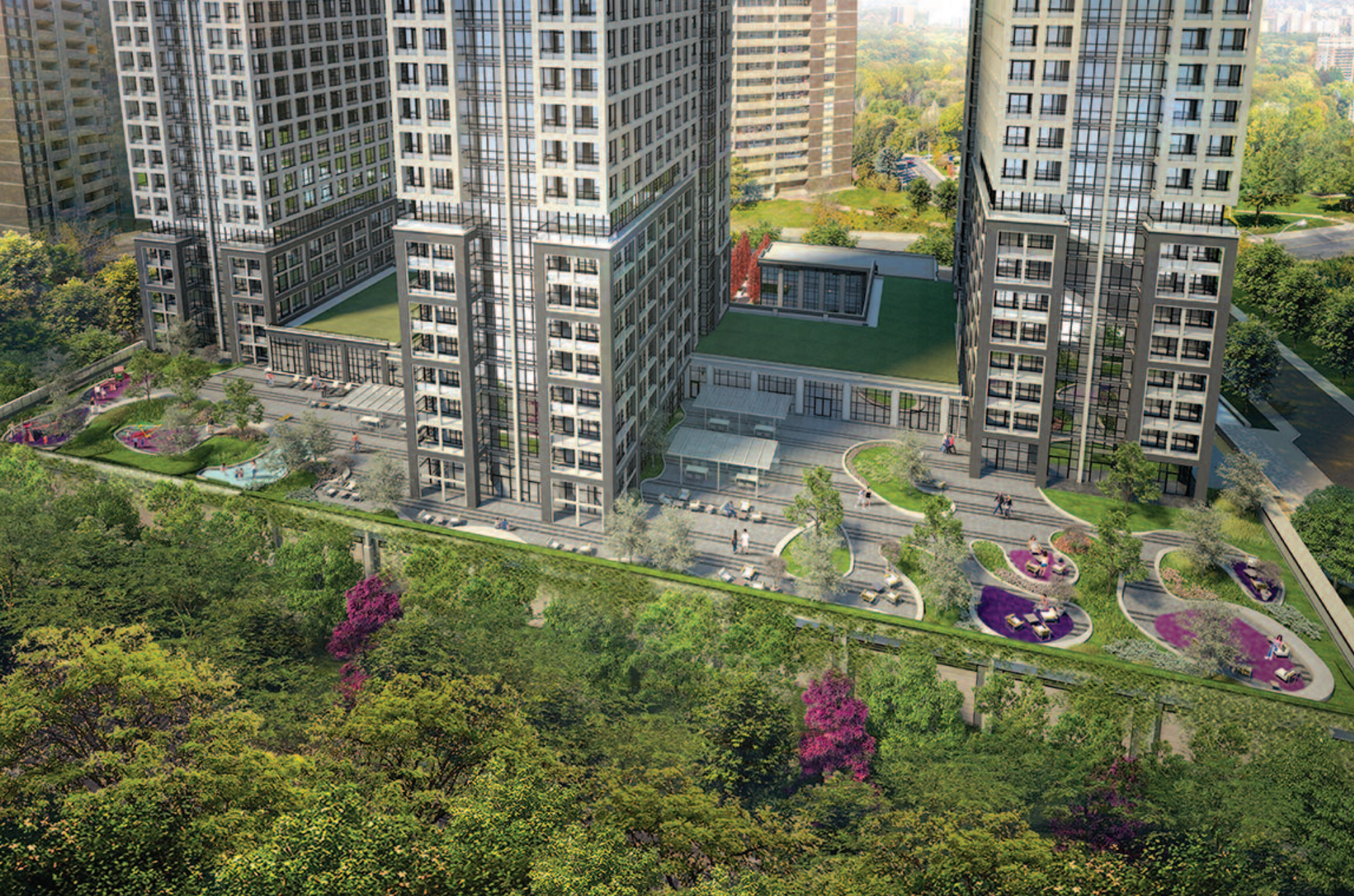
Terrace Club indoor/outdoor amenity spaces.