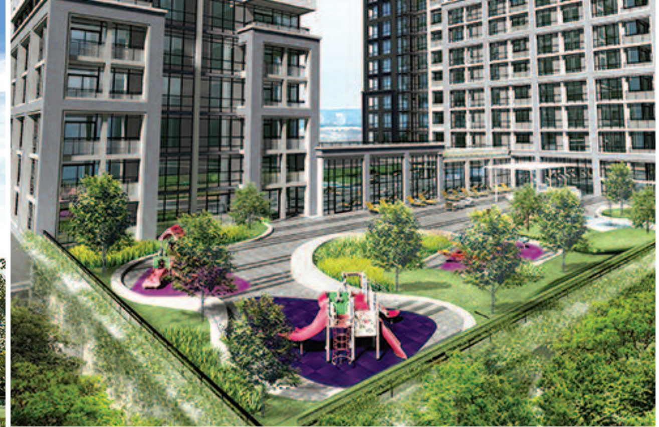
Children's Play Zone