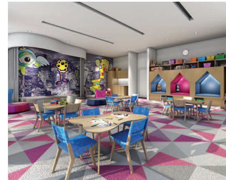
Children's Play Room

Outside, the Amenity Terrace offers equally indulgent leisure spaces, creating a veritable rooftop oasis. Out here, organic Lounge alcoves dot the perimeter complemented by lush landscaping and open green spaces. A sun deck is featured off the indoor Swimming Pool, BBQ Dining Areas and a large, dedicated Children's Play Zone with Splash Pool complete the picture.