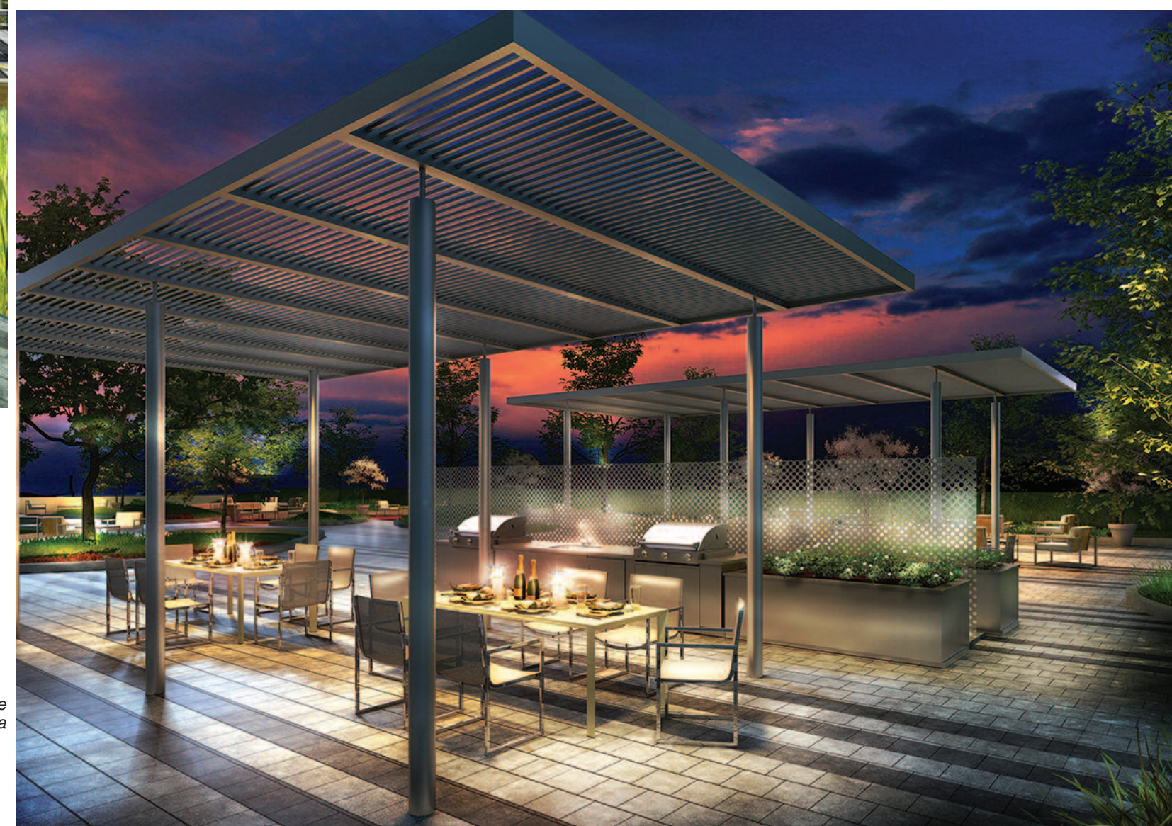
Barbeque Dining Area